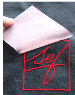
Remove liner, done!

The VelCut Fashion Series has 13 current designs.