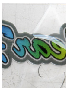
Weed on the Tape

Before the designs can be transferred the ink should be dry, otherwise the print could potentially smudge. This can take one to six hours depending on the ink used and the ambient conditions.