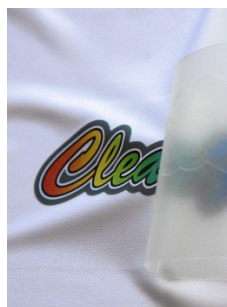
Remove liner, done!

The cut and weeded scripts, or designs, are ironed on to the textiles for 15 sec. at 160° C. The mounting film can be removed after a short cooling period.